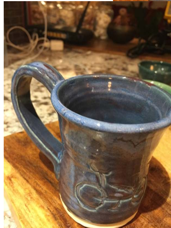
Bicycle and clothesline cups