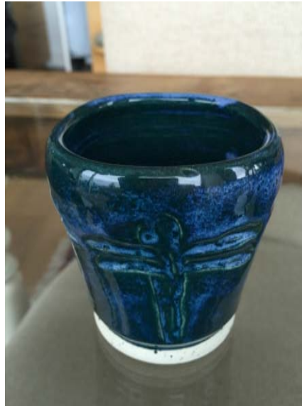
One carved dragonfly square cup

Notes: carved lines makes top glaze pool in lines and in carved bits – in this case the opal