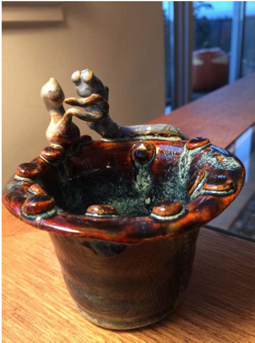
Alice in Wonderland cup