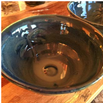
2 Medium bowls with dragonfly carved inside