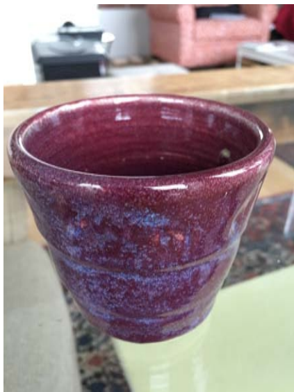
One wide cup with leaves