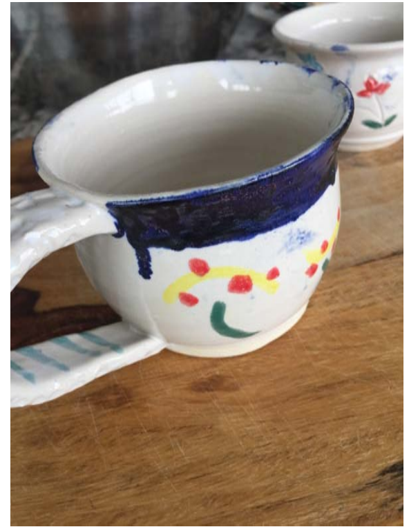
Practice stains for matching my Italian teapot

I love this combination. Someone said it reminded them of the old campfire tin cups.