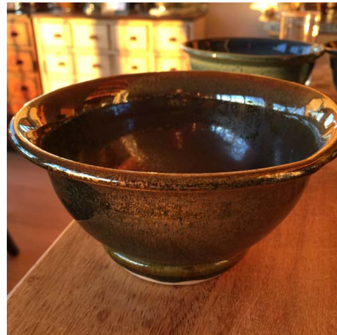
Planter bowl with saucer