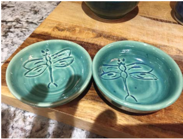
Dragonfly soy bowls