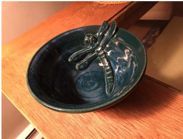
Small dragonfly sculpted bowl

Notes: Gorgeous, happy with the whole thing