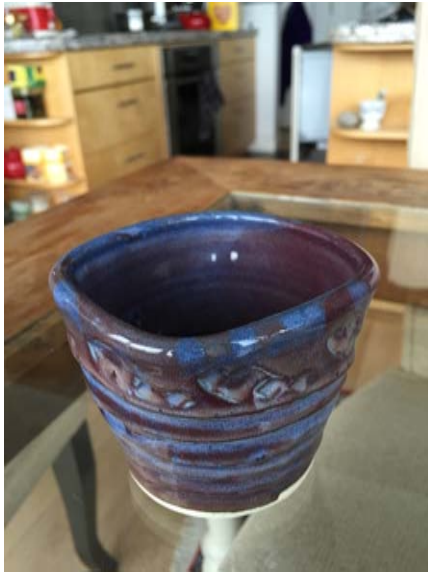
One square cup with carved fish And lines

Notes: Absolutely gorgeous. The turquoise pools in the lines and looks dark blue