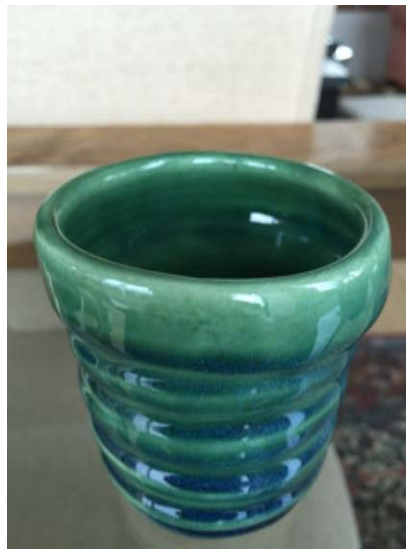
One groovy cup

Notes: carved lines makes top glaze pool in lines – in this case the opal