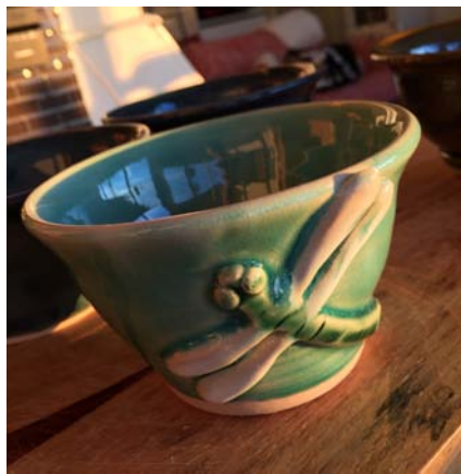
Small dragonfly sculpted bowl

Notes: Very purple. Some turquoise peeks through. Doesn't make the carving stand out. Raspberry on top makes it turn out purple. Turquoise over raspberry is probably better